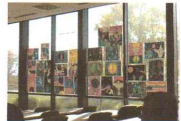
Entries from the 3 schools were displayed for the guests to admire the talents of the children in our area