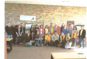
GHBLC members posed with the winners, parents, governor, teachers after the event